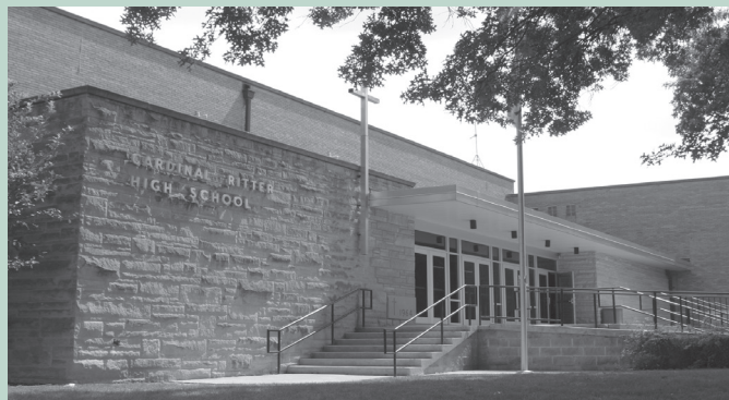
Cardinal Ritter High School

Cardinal Ritter is a Catholic high school entrusted by the Archdiocese of Indianapolis and the parishes of the West Deanery to provide a comprehensive educational program to students of diverse socioeconomic, racial and religious backgrounds by challenging them spiritually, intellectually, athletically, and artistically. The Cardinal Ritter community values and fosters the unique intellectual, cultural, social, and physical gifts of each student; we consider personal growth, wholeness and holiness central to our ministry. As followers of Christ, we encourage our students to share their gifts and talents in service to others.